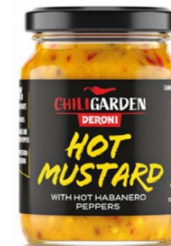
HOT MUSTARD WITH HABANERO PEPPERS 155g