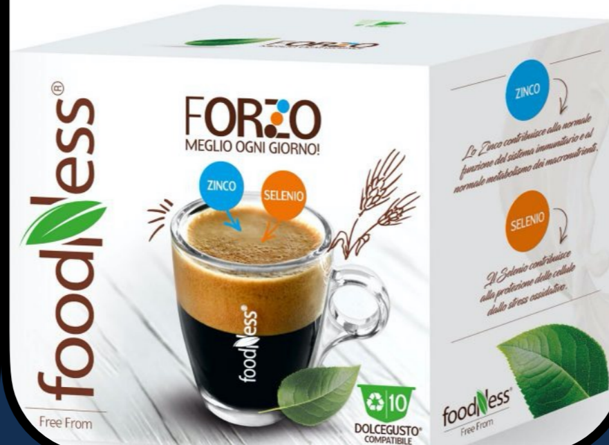
Barley 120GR 6/C