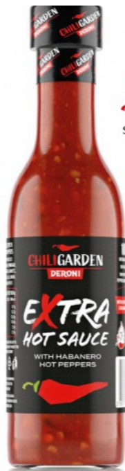
GARLIC & HABANERO HOT SAUCE 200g