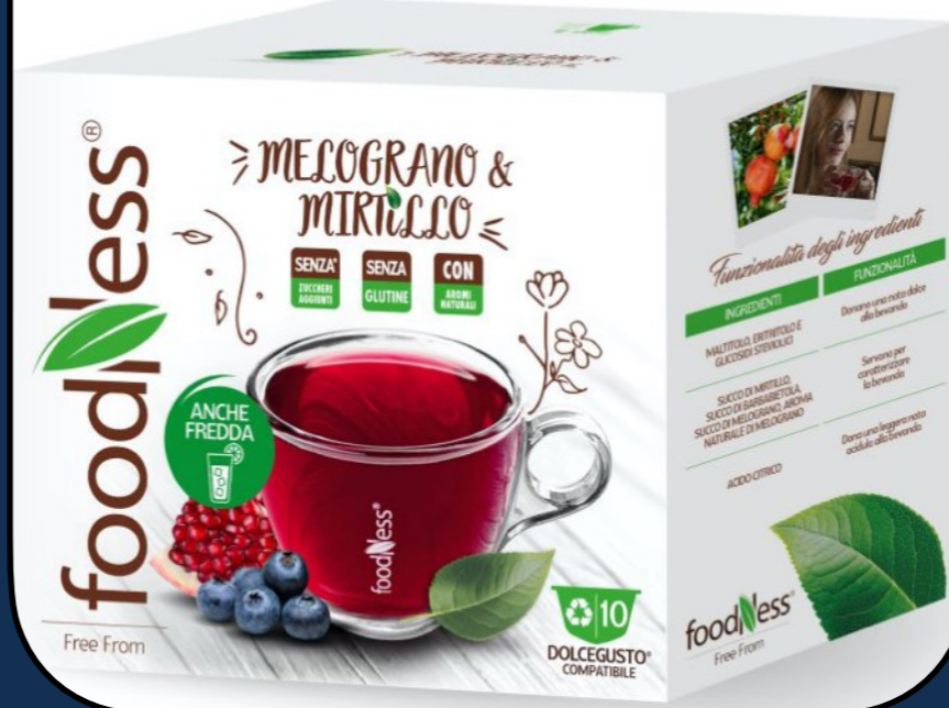
Poegranade & Blueberry 150GR 6/C