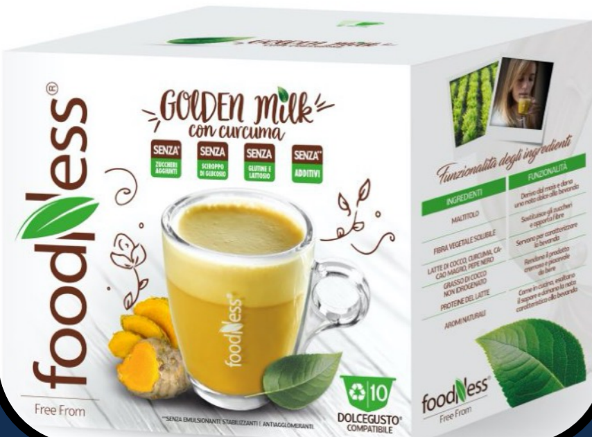
Golden Milk with Tumeric 120GR 6/C