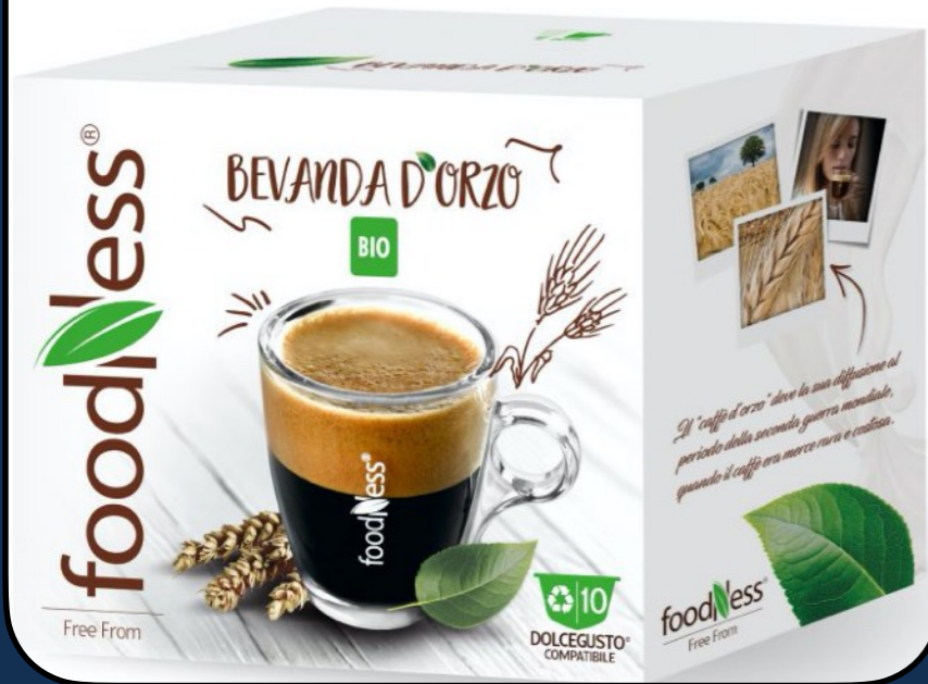
Organic Barley 120GR 6/C