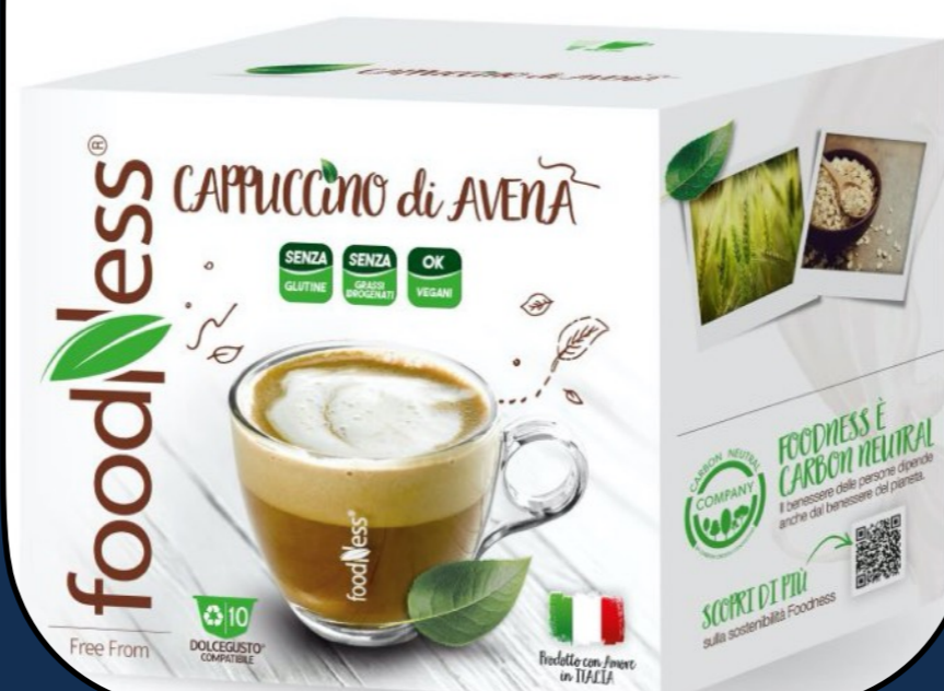
Oat Cappuccino 130GR 6/C