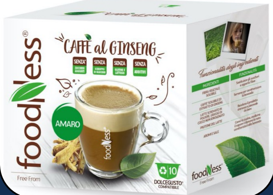
Ginseng Coffee unsweetened 120GR 6/C