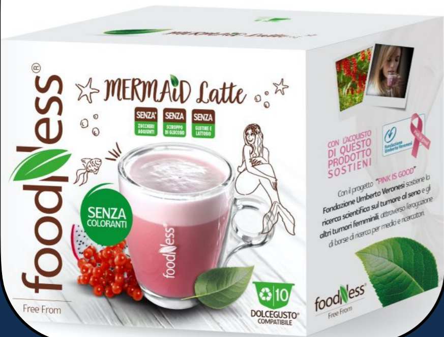
Mermaid Latte 120GR 6/C