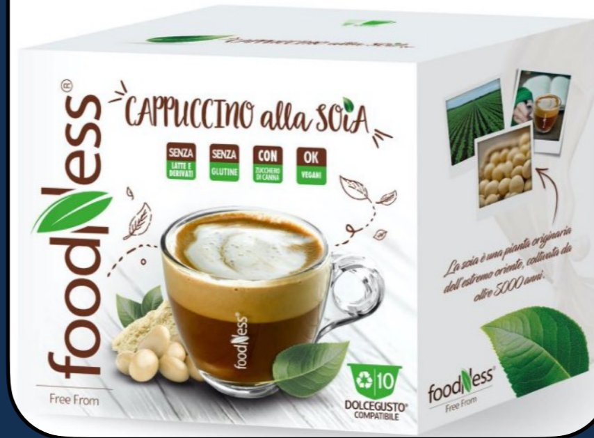
Cappuccino Soya 150GR 6/C