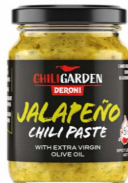
JALAPEÑO CHILI PASTE WITH EXTRA VIRGIN OLIVE OIL 145g