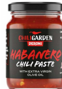
HABANERO CHILI PASTE WITH EXTRA VIRGIN OLIVE OIL 145g